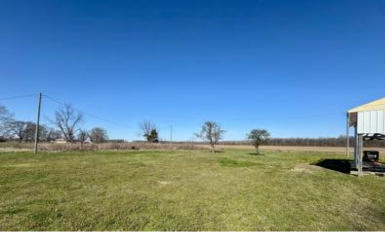
A Real Estate Expert You Can Trust!