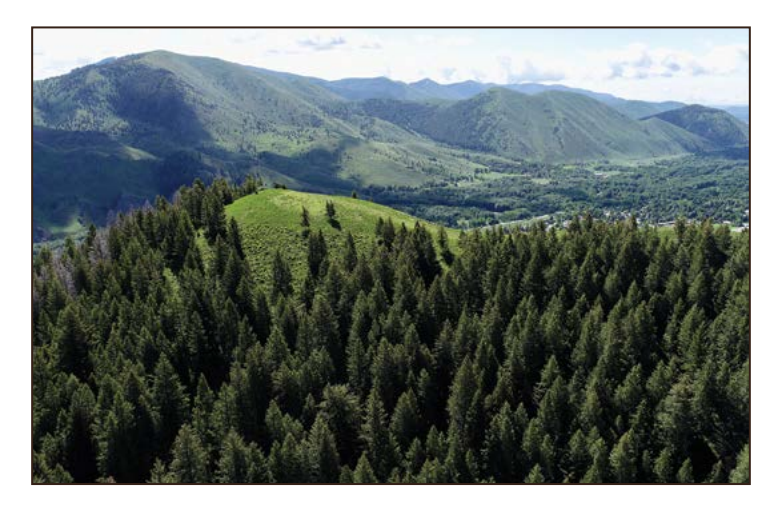
This information is subject to errors, omissions, prior sale, change, withdrawal and approval of purchase by owner. All information from sources deemed reliable but it is not guaranteed by Hall and Hall. A partner at Hall and Hall is the agent of the Seller. A full disclosure of our agency relationships is included in the property brochure available at www.hallandhall.com or by contacting the Listing Broker.