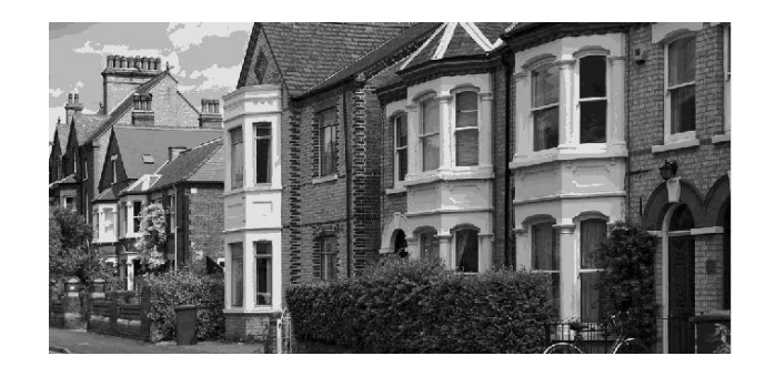
Produced with zipForm® by zipLogix 18070 Fifteen Mile Road, Fraser, Michigan 48026 www.zipLogix.com

• Read EPA's pamphlet, The Lead-Safe Certified Guide to Renovate Right, to learn about the lead-safe work practices that contractors are required to follow when working in your home (see page 12).