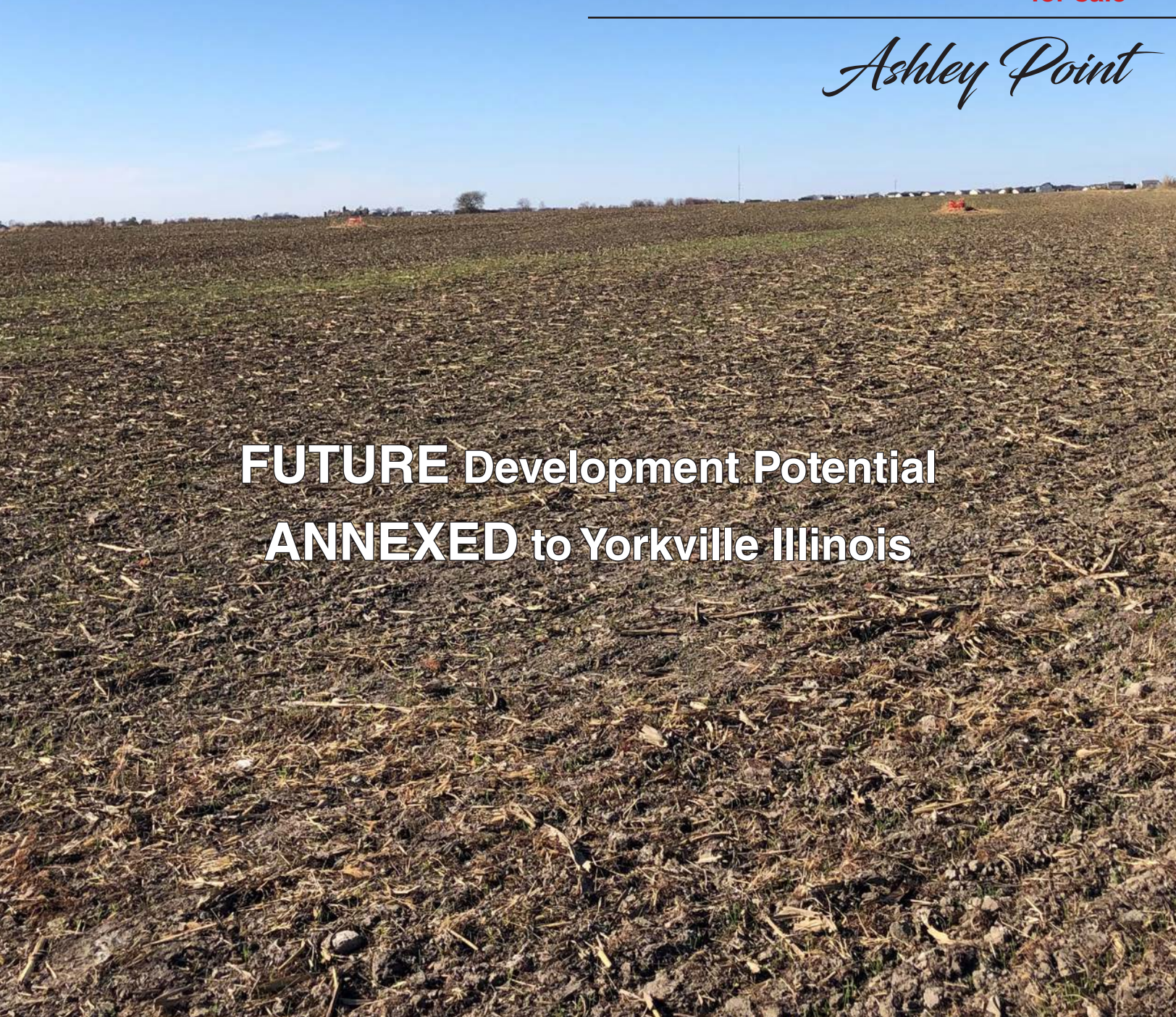
looking West, 11.11.23