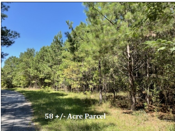
58 +/- Acre Parcel

All information furnished is assumed to be accurate and correct. However, neither the property owner nor Midsouth Forestry Services warrant the accuracy of information furnished. Prospective buyers should satisfy themselves as to the accuracy of this information. No representation or warranties are expressed or implied as to the property, its condition, boundaries, access, acres, zoning, condition of title or fair market value.