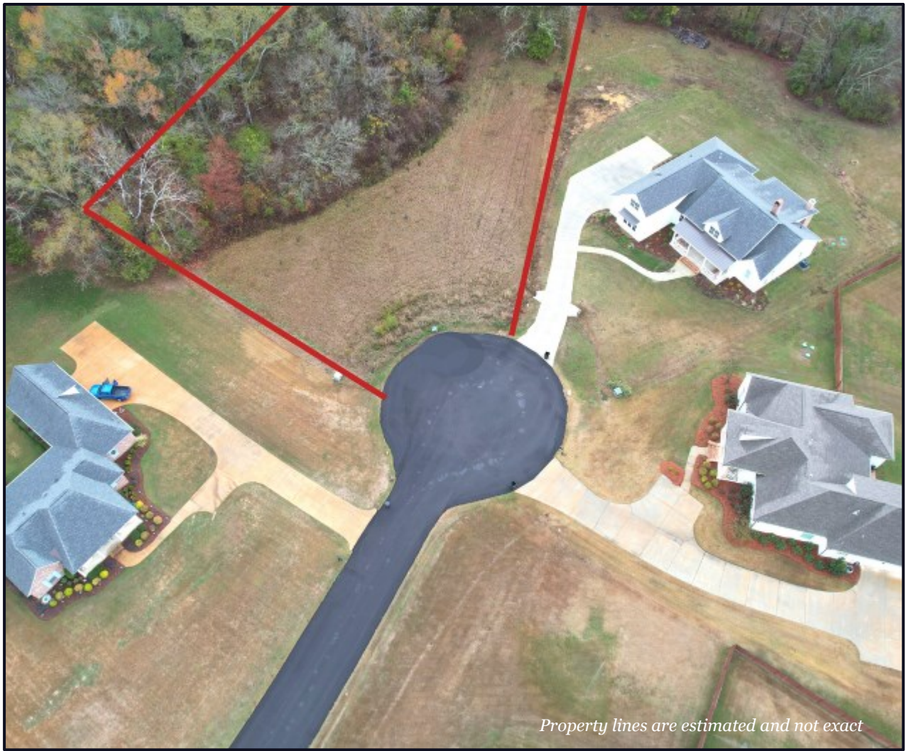
Property lines are estimated and not exact