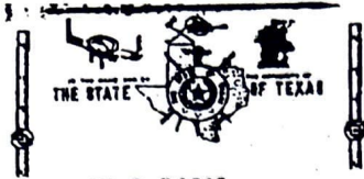
EXHIBIT " A "