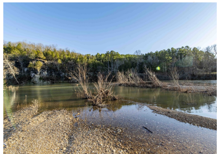
Broker does not guarantee the accuracy of sq. ft., lot size, or other information, buyer is advised to independently verify the accuracy of information through personal inspection and with appropriate professionals