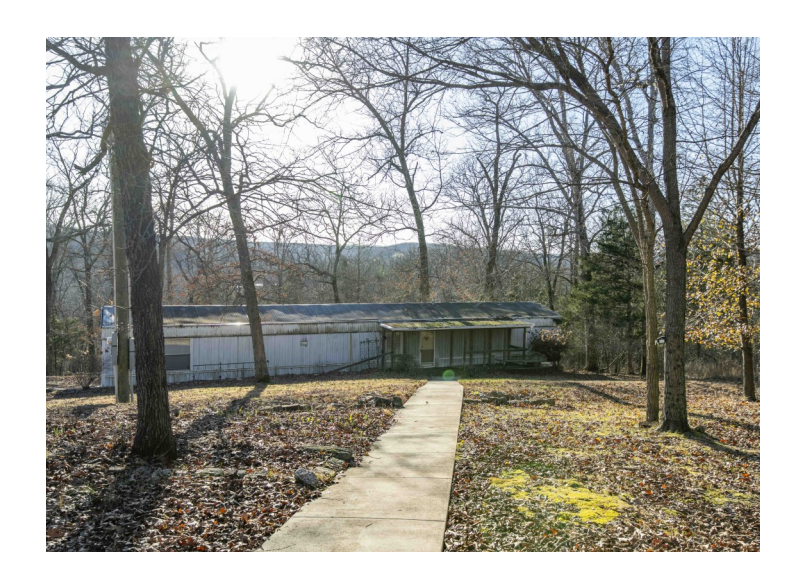
Broker does not guarantee the accuracy of sq. ft., lot size, or other information, buyer is advised to independently verify the accuracy of information through personal inspection and with appropriate professionals