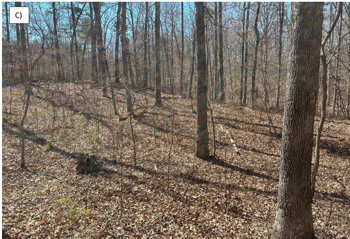
Figure 1. A) Most of the property is dominated by hardwoods with some in the overstory and midstory, but there are some pockets that are dominated by pine. B) Old stump on the property from a timber harvest that occurred about 15 years ago. C) Maturing stand of mixed oak that will likely be ready for a harvest in 20-30 years.