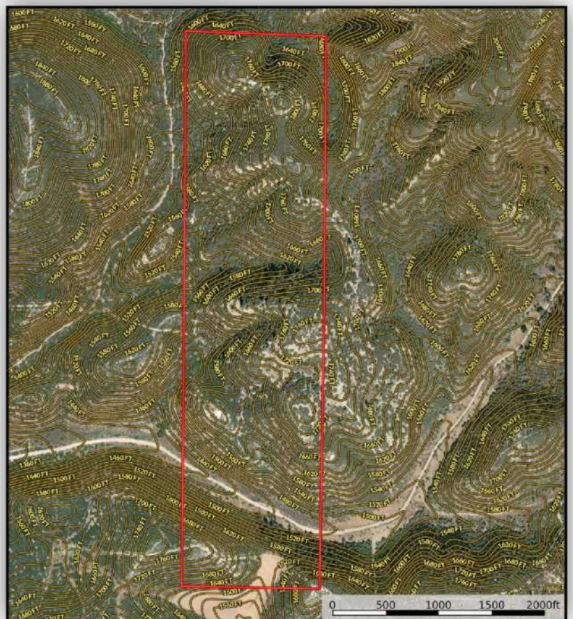
Aerial Map with Contour Lines