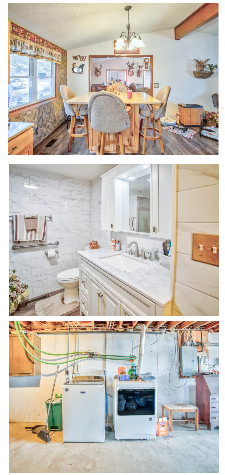
Broker does not guarantee the accuracy of sq. ft., lot size, or other information, buyer is advised to independently verify the accuracy of information through personal inspection and with appropriate professionals