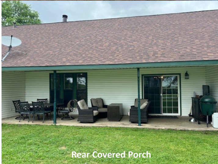
Rear Covered Porch