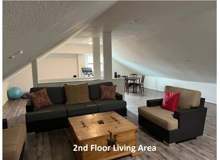
2nd Floor Living Area