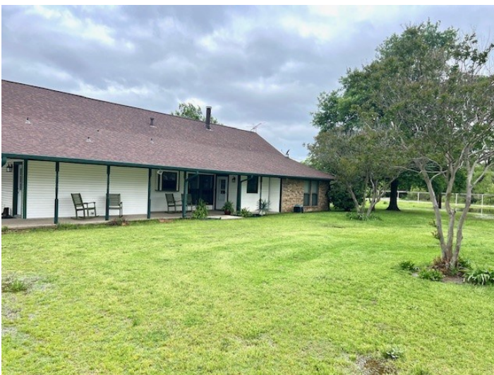
Front View of Home

2021/2022 Updates: paint throughout, luxury vinyl flooring throughout, granite counters in kitchen, appliances