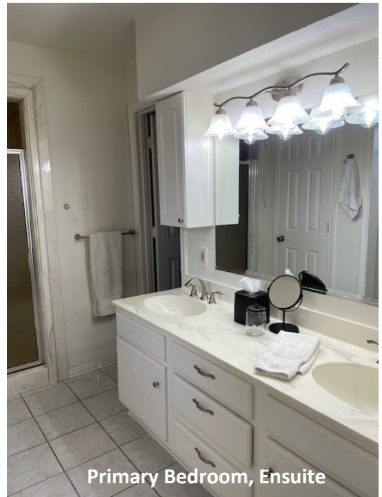
Primary Bedroom, Ensuite