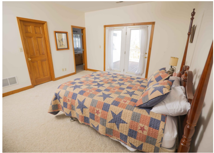
Broker does not guarantee the accuracy of sq. ft., lot size, or other information, buyer is advised to independently verify the accuracy of information through personal inspection and with appropriate professionals