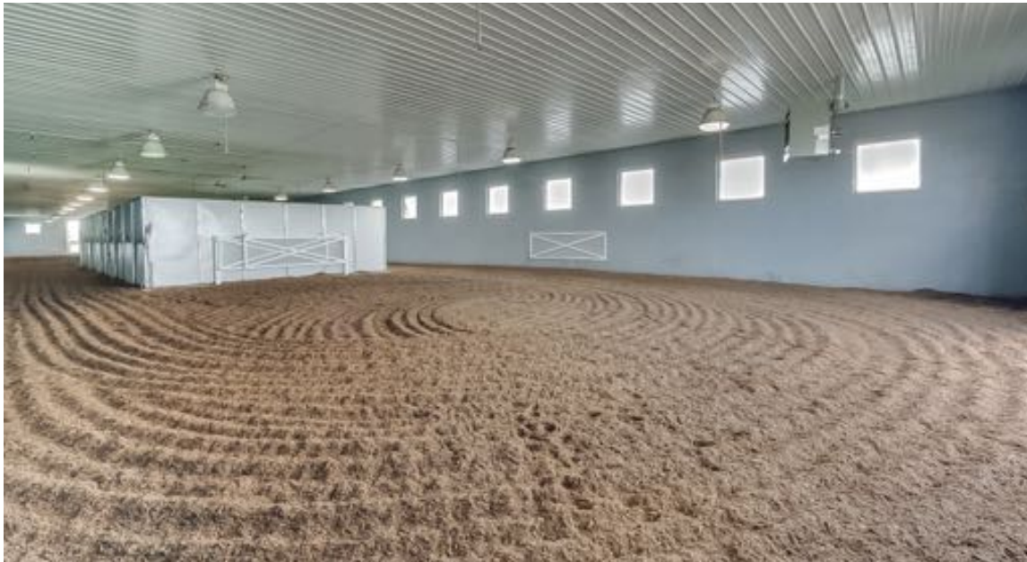
250'x50' heated indoor arena