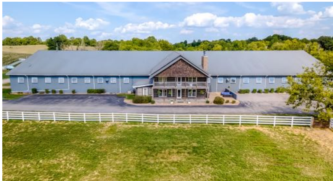
34 stall barn