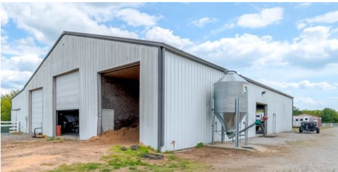
60'x100' metal storage barn with 18ft overhead doors