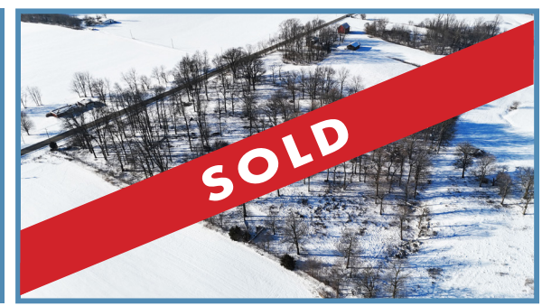
7.893 +/- Acres 7.5+/- Woods • 0.4+/- Other LISTING PRICE: $130,000