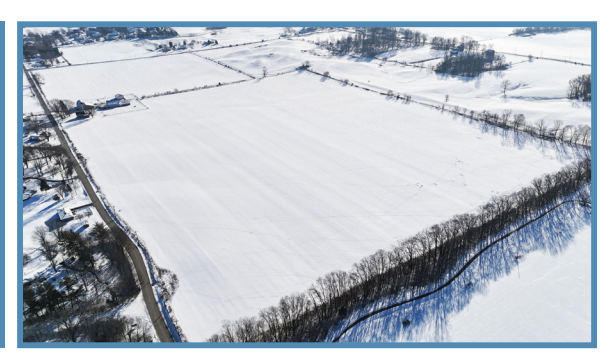
58.428 +/- Acres 57.48+/- Tillable • 1.52+/- Other LISTING PRICE: $995,000