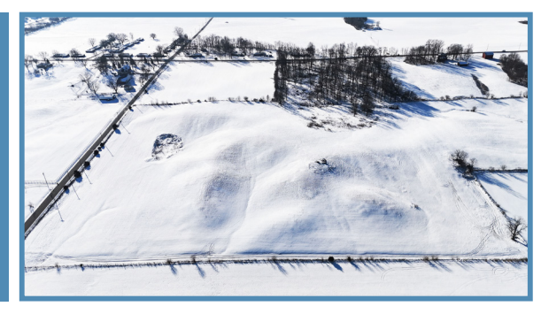
22.933+/- Acres 22+/- Pasture • 0.6+/- Other LISTING PRICE: $379,000