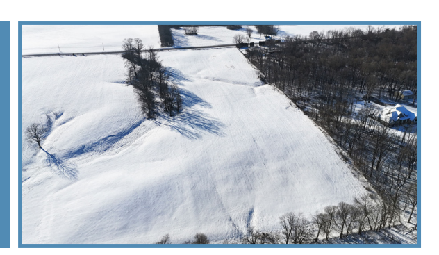
13.099 +/- Acres 10.8+/- Pasture • 0.2+/- Other LISTING PRICE: $216,000