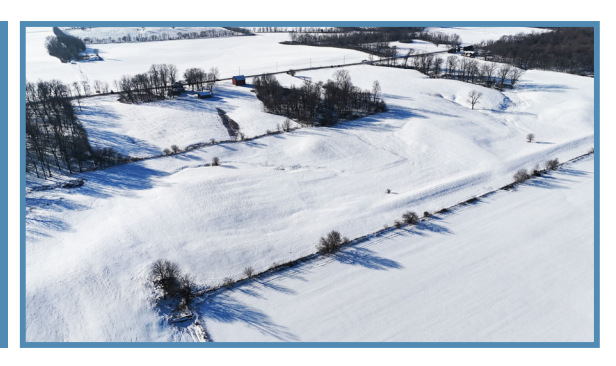
23.973 +/- Acres 26+/- Pasture • 0.2+/- Other LISTING PRICE: $395,000