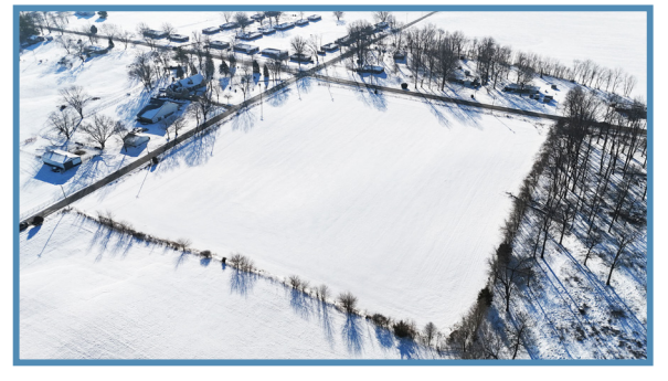
9.479 +/- Acres 8.77+/- Tillable • 0.73+/- Other LISTING PRICE: $200,000