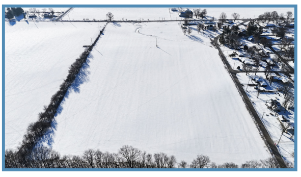
27.337 */- Acres 25.76*/- Tillable 0.49*/- Non-Tillable • 1.09*/- Other LISTING PRICE: $465,000