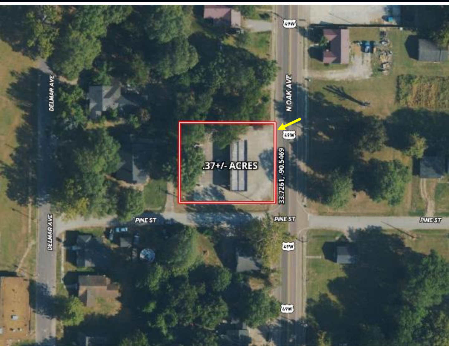
Click Here for an Interactive Map Link