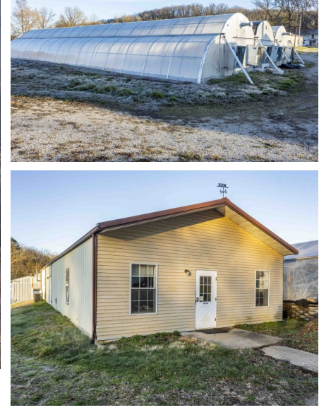
BIDDING ENDS WEDNESDAY, APRIL 30<sup>th</sup> at 10:00 AM See Full Terms & Conditions at www.trophypa.com

PROPERTY ADDRESS: 18944 Saint Albans Road Wildwood, MO 63038