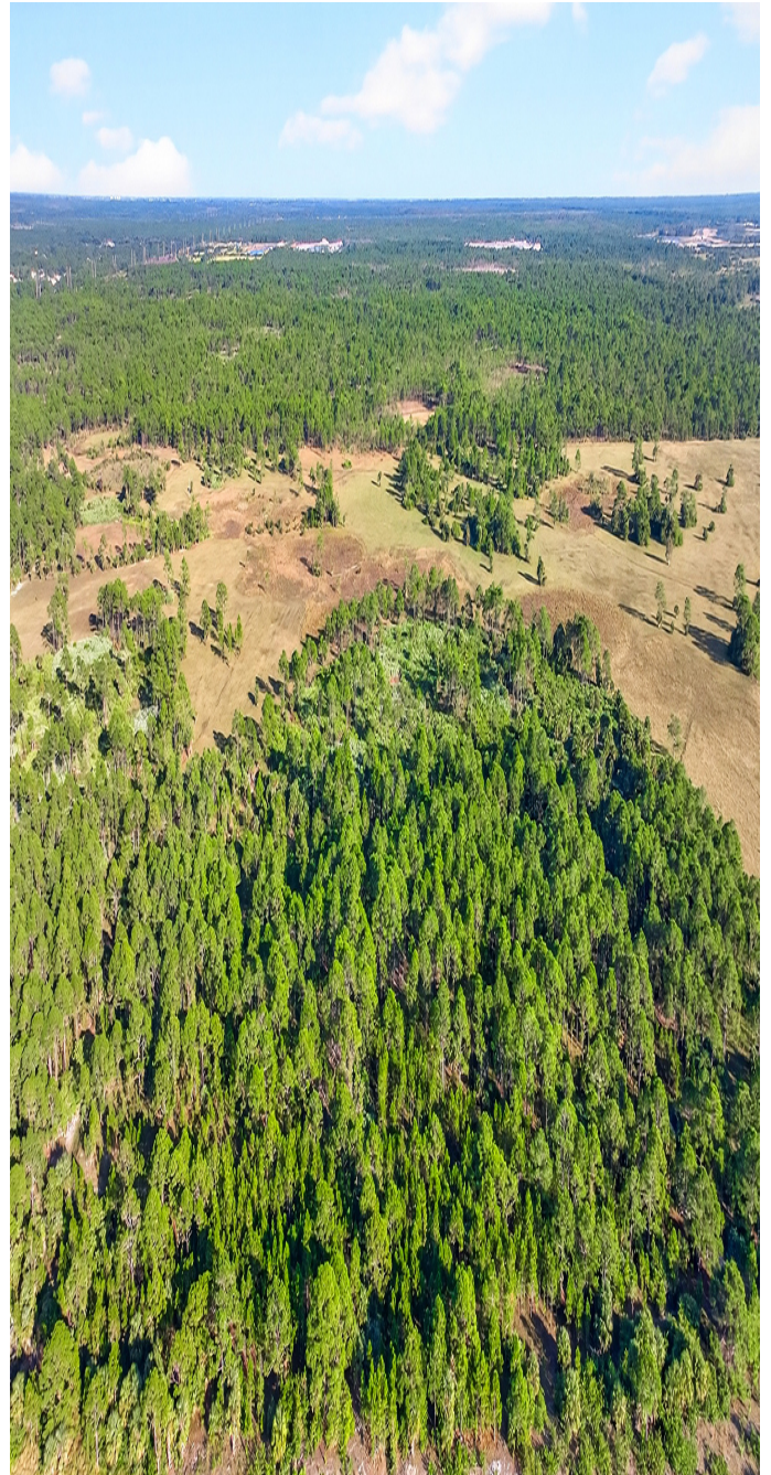
Calumet Farm : West Central section of the property looking East