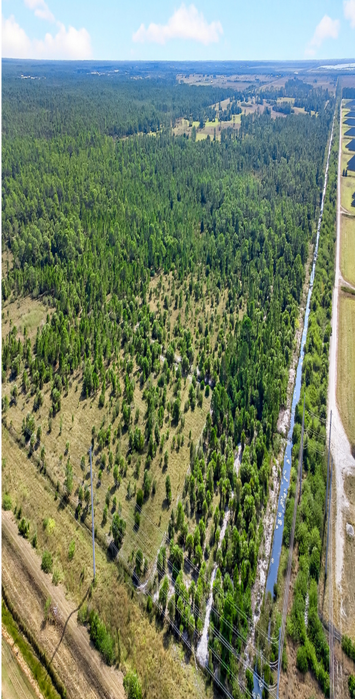
Calumet Farm - North West Corner of the property