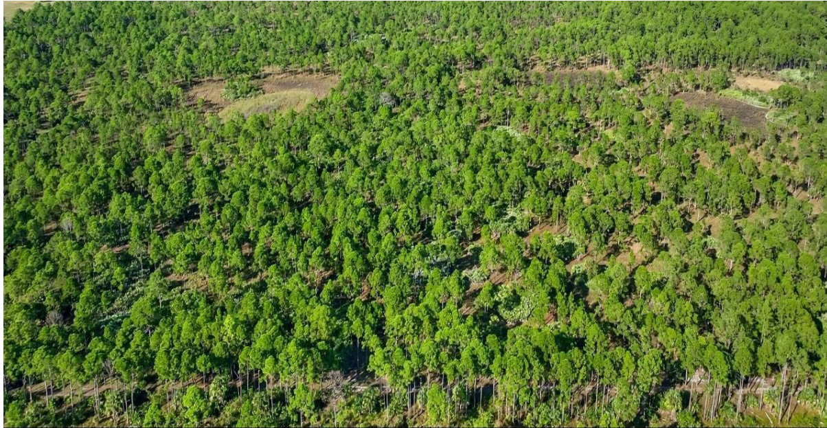
Calumet Farm: South West of Property looking North