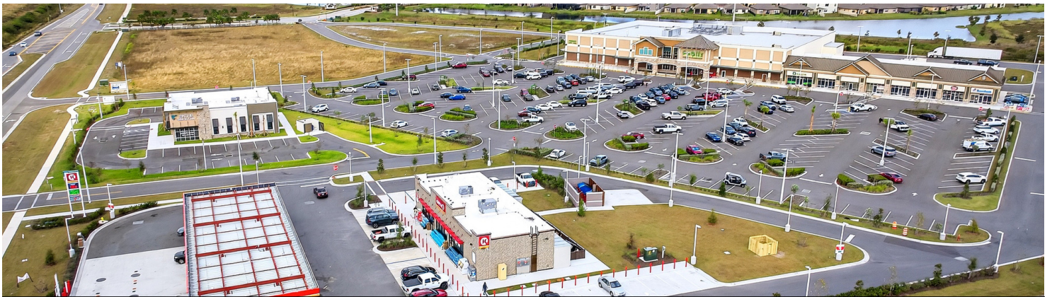
Waterstone - This picture is of the New Publix Grocery and Circle K Convenience and Gas