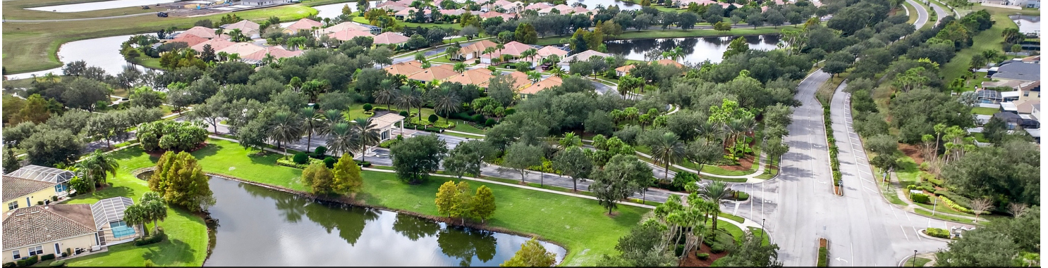
Waterstone - Mara Loma Blvd looking east towards Babcock Street and Cypress Bay Preserve. Photo was taken about 1/4 mile west of Babcock looking easterly