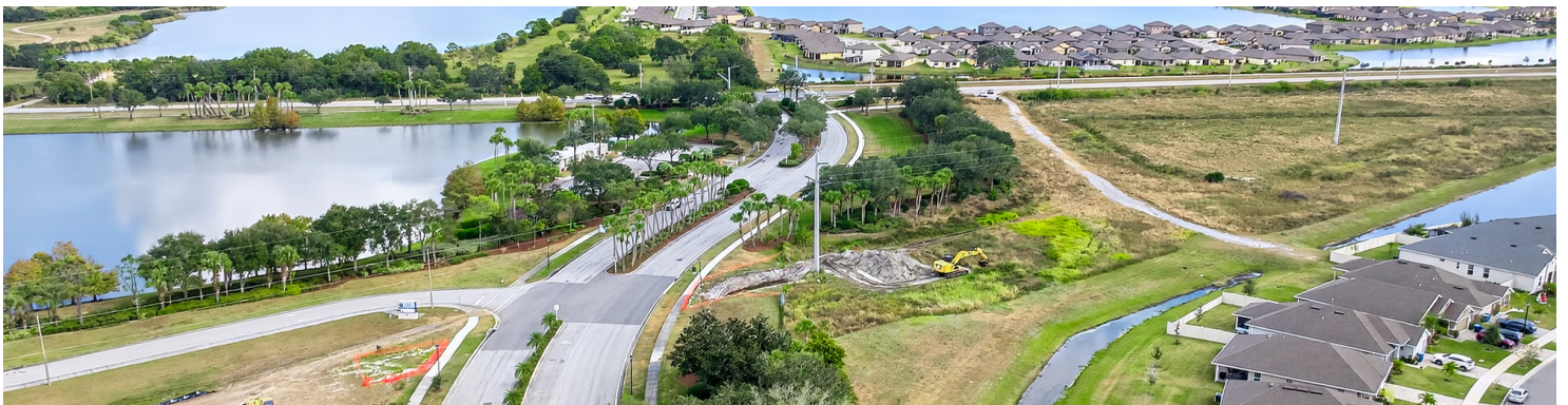
Waterstone - Mara Loma Blvd looking west at the entrances off Heron Bay and the Lakes at Waterstone (photo was taken about 1/2 mile west of Babcock looking westerly towards new phases by Dr Horton and KB Homes)