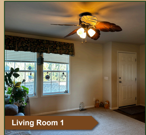
Living Room 1