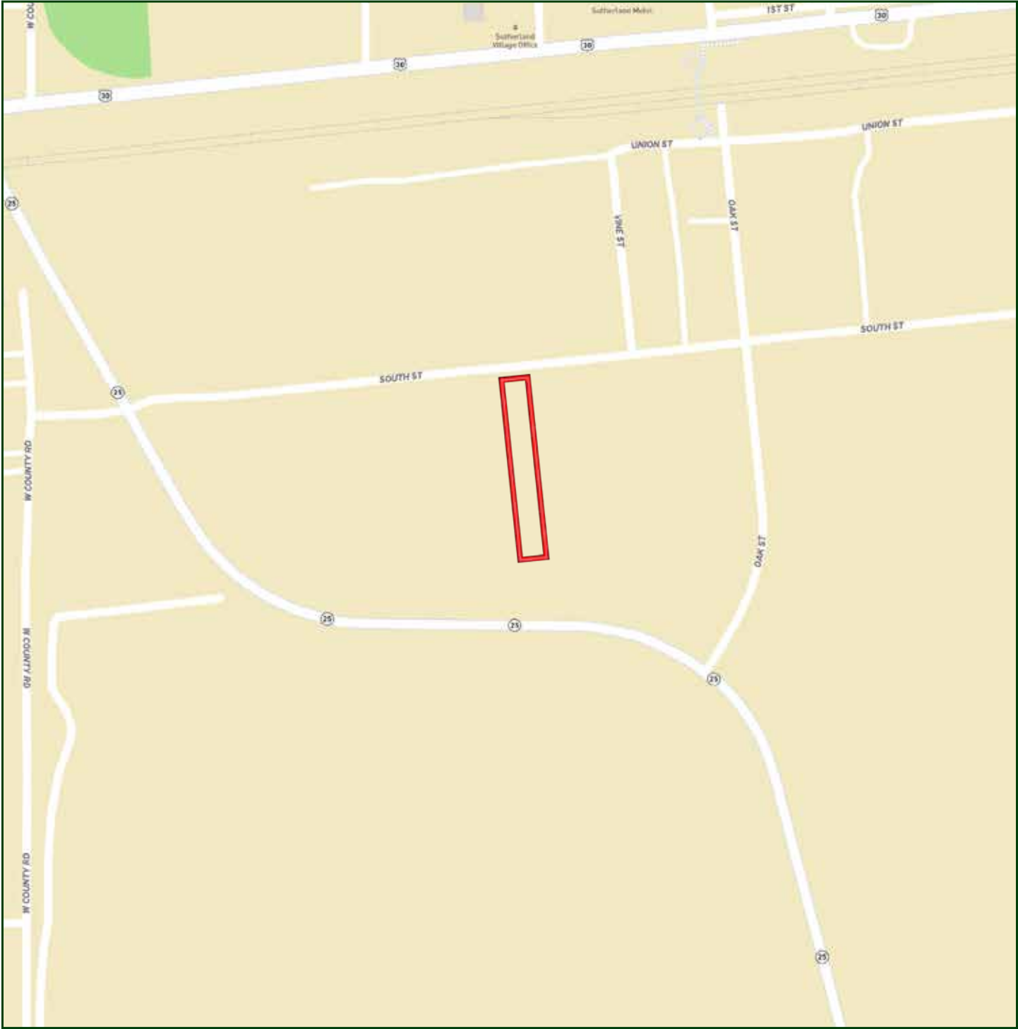
Boundary lines are estimates - Map for illustration only

BRANDI HOUSMAN Sales Associate Brandi's Cell: 308-568-9435 Email: brandi@lashleyland.com