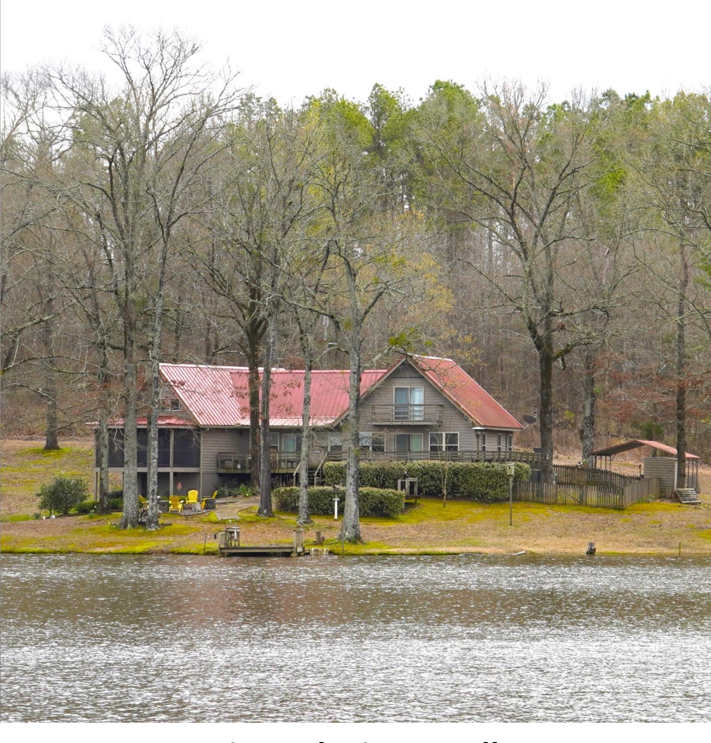
Home on Spring Lake in Carroll County, MS