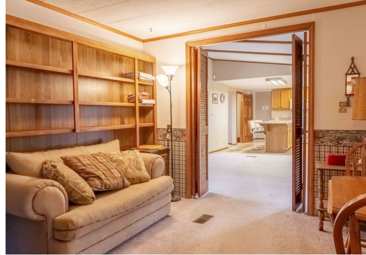
Broker does not guarantee the accuracy of sq. ft., lot size, or other information, buyer is advised to independently verify the accuracy of information through personal inspection and with appropriate professionals