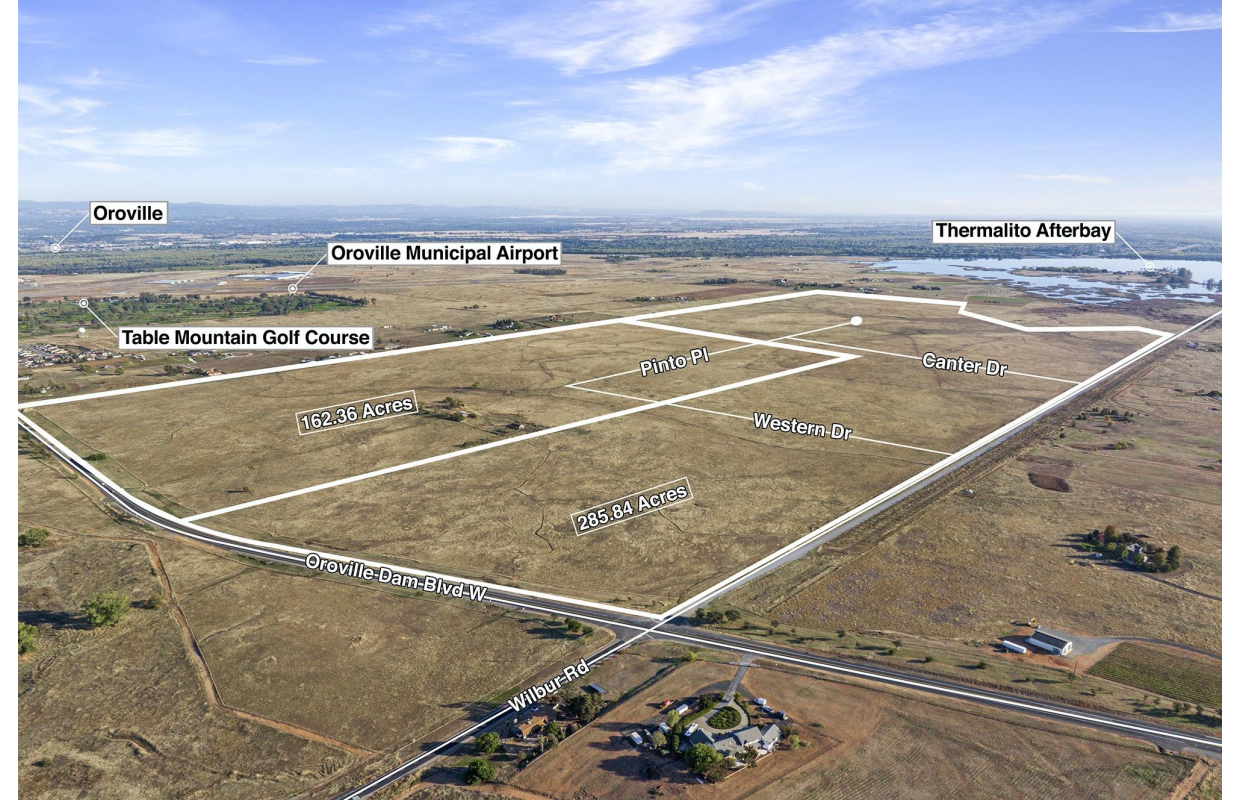
$12,000,000 or just over ($28,500 PER ACRE)

Oroville, Ca. 421 ACRE IMPRESSIVE LAND TRACT! (Prior site of the large-scale ambitious 2,400 lot "Oro Bay Subdivision" and city limit annexation project proposal where the city approved "The Development Agreement" for this project October 5th, 2010; but has since expired). Comprising 2 adjacent parcels backing Oroville's popular Thermalito Afterbay, a 4,300 surface acre water recreation area. This is the largest parcel of its size off Oroville's main thoroughfare; (Oro Dam Blvd/State ROUTE 162) between Highway 70 & Highway 99. Oroville's scenery is quickly changing with development. Nothing compares to this magnitude and size within close proximity to the city limits off SR162. This land tract sits 1,100+/- feet to the west of