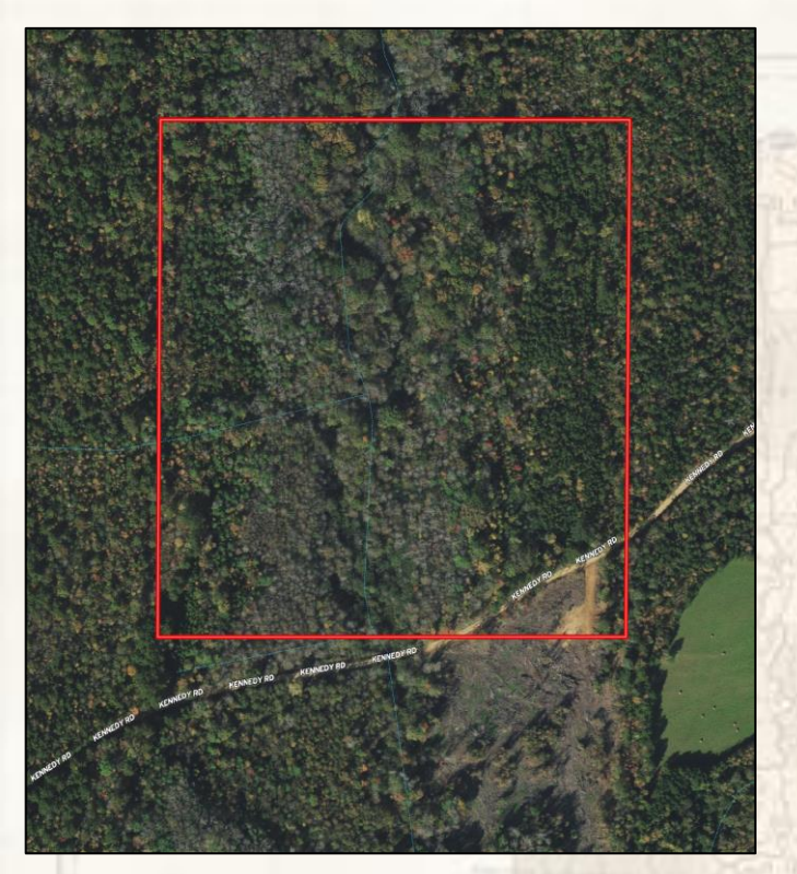
Map Right Link