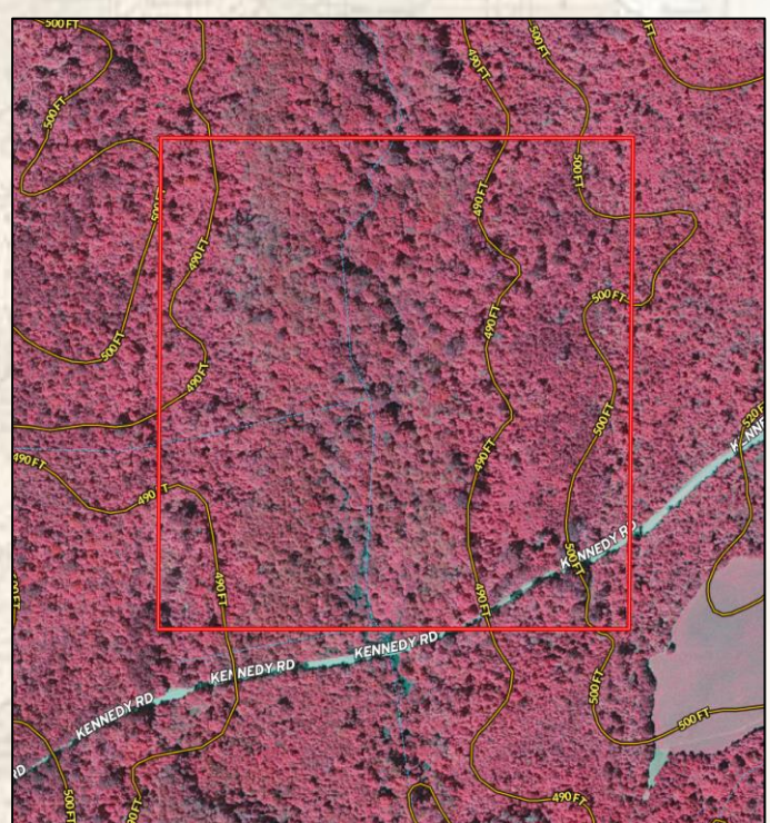
Google Map Link